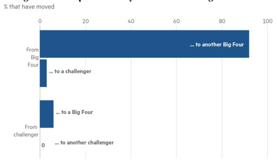
Figure 33 Companies rarely switch to challenger audit firms

Another fact that has been concluded by the Committee in the report is that once a company has been a Big Four client, it rarely switches to audit companies other than the Big Four. Moreover, when a company decides to shift from a challenger audit company, it absolutely always does that towards an audit company amongst the Big Four.